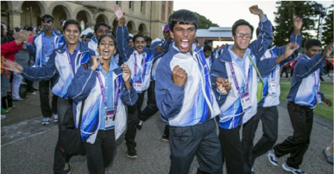
The Olympic medals India won and ignored. Jan 2014