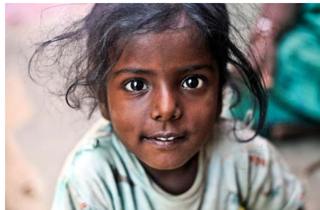
Aged 6, weighing 12kg, she dies a quiet death. Aug 2013

'News in proportion' is one of our guiding principles. We tell the stories of the urban poor and underprivileged, whose voices are rarely heard by other classes. Stories on malnutrition among kids in a slum area in Bangalore , how urban poor are deprived of all the schemes made for them , evictions of