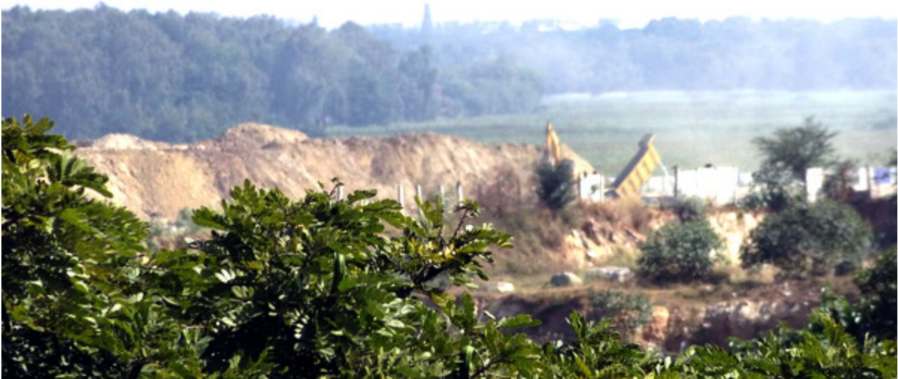
Green Tribunal orders an interim stay on Mantri's Bellandur project. Mar 2014

3. Helping people get multiple perspectives on various issues: Our writeup on the housing scheme by Bangalore Development Authority - the local planning authority is a good example of this. We wrote about BDA's apartment scheme and different views about it. When BDA made allotments, people hard-pressed for details, landed up on the Citizen Matters article. When they found no way to interact with the government, they even started interacting in the comments section of this article. Their concerns and doubts encouraged us to follow up with another article on the topic.