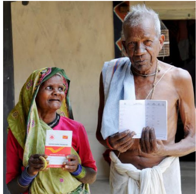
Significant, but hardly enough! Jan 2014

The interviews with historian Ramachandra Guha on India's leaders, Telangana and the communal riots in Uttar Pradesh were well received by readers.