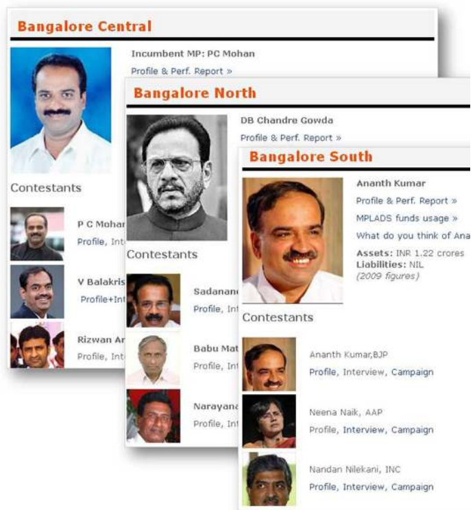
Lok Sabha Elections 2014 on Citizen Matters. Mar 2014

We interviewed a large number of candidates, followed their campaign trail and actively engaged citizens through the course of the election season. Our informative articles for voters, from candidate profiles to the inaccuracies in the voter roll were very popular - they helped voters get registered online easily inspite of the many bugs in the system and make an informed choice on election day.